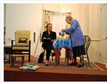
020 8640 6800, email: info@attictheatrecompany.com or visit www.attictheatrecompany.com

The production reached several audiences totalling more than 300 people in Bromley borough and more productions are planned.